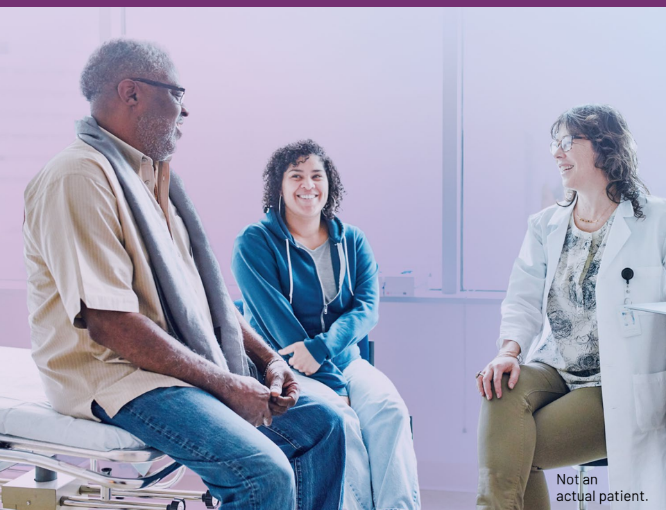
Not an actual patient.